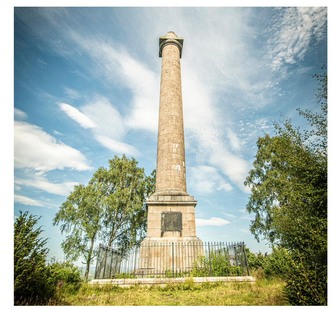
Torr Alvie

2022 will be the Year of Scotland's Stories which will be a showcase of the country's rich literature, oral traditions and myths and legends. Badenoch should be well positioned to benefit from the opportunities that this year of celebration will bring and has the chance to become renowned for its rich cultural heritage.