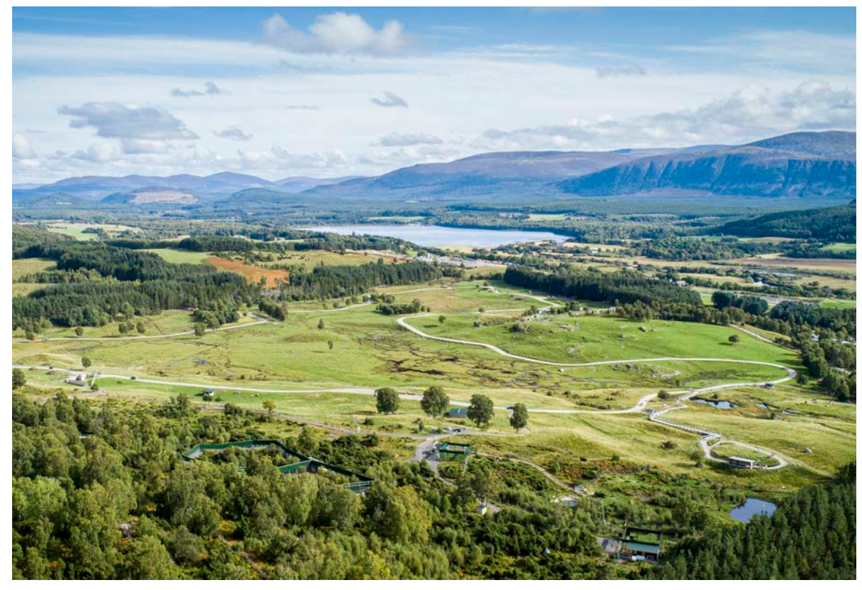
Highland Wildlife Park