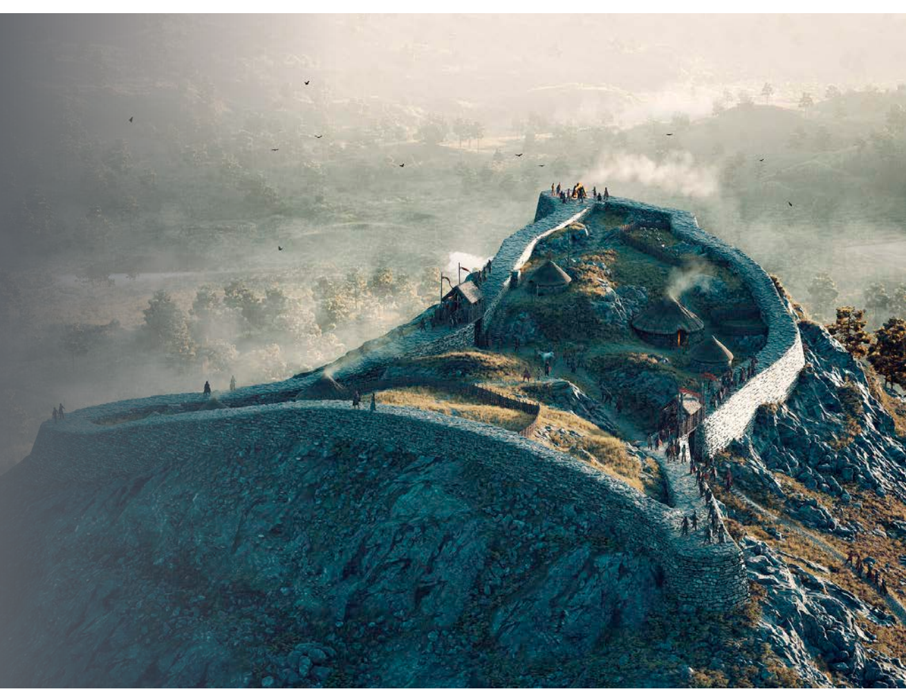
Digital Reconstruction of Dun de Lamh hillfort near Laggan